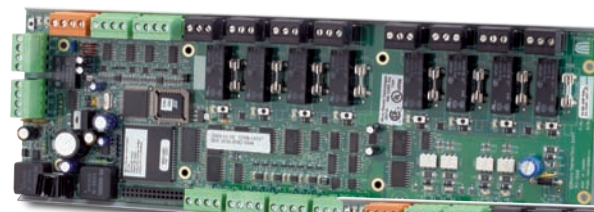
MT-508 Energy Node